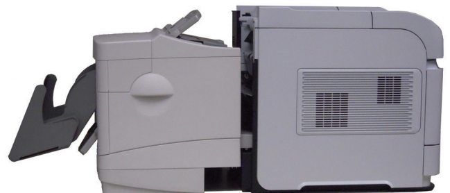
PTM 606 Accessory shown attached to an HP 604 printer